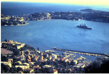
Villefranche in 1962

Since the 1980s Villefranche has been used by cruise ships and is the most visited cruise ship port-of-call in France. How fortunate we were to have been able to enjoy having it as our home port.